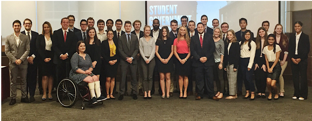
Members of the 2018-2019 Student Government Association