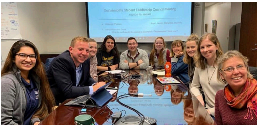
First Meeting of the Student Sustainability Leadership Council (SSLC)