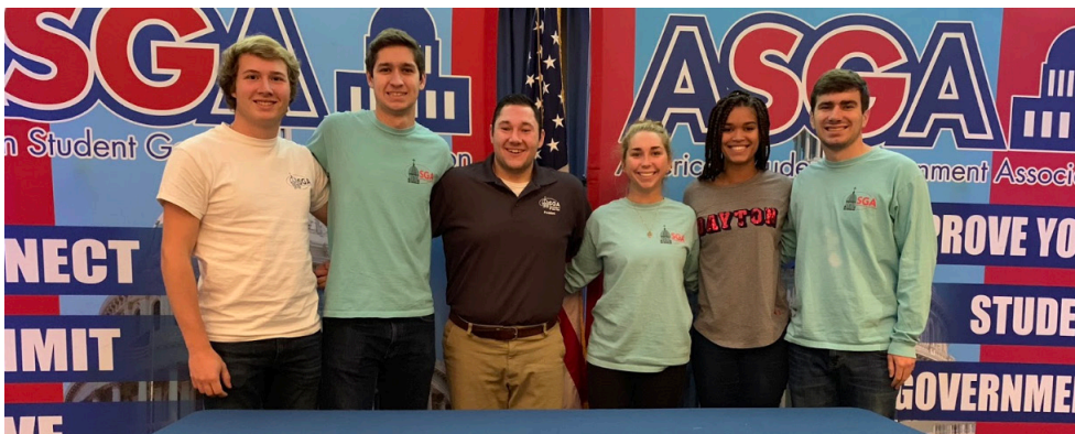
American Student Government Association Conference Attendees (Washington, D.C.)