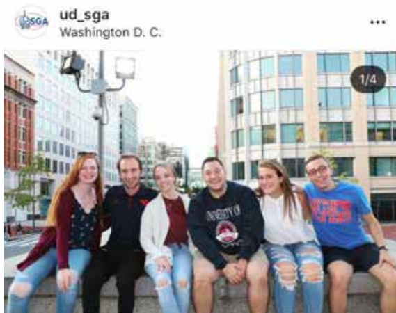
ud_sga Thanks for having us, DC! UDSGA has a BLAST at the 2019 National ASGA Student Government Conference! We are so excited to bring lessons back to campus. See you soon, Flyers! 🇺🇸🇺🇸 October 13, 2019

American Student Government Association National Conference - Washington, D.C.